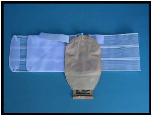
EZ-Clean Ring Support Belt

This proprietary Support Belt was designed by Schena Ostomy Technologies and manufacturing engineered by Nu-Hope Laboratories for use with the patented EZ-Clean Pouch. The support ring has an opening at the top that allows the belt to be slipped on to the wafer from the bottom and it has a special hook & loop support strap that secures the top of the pouch. Designed to accommodate the water feed inlet of the EZ-Clean Pouch, the 6 inch wide belt is mesh for cool comfort and support. Available is size: small, medium, large and extra-large. This support belt can be ordered from the catalog on our web site: www.ostomyezclean.com . For additional information please contact: Schena Ostomy Technologies, 2313 Harrier Run, Naples, Florida 34105, Tel: 239 263-9957, Email: kenschena@ostomyezclean.com